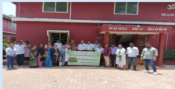
Plants Handed over to Abhayashrama Assaigoli in coordination with RCC Kolya