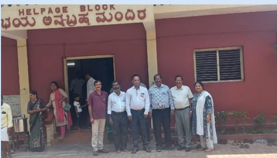
Programme at Abhayashrama Assaigoli in coordination with RCC Kolya