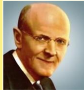
Rtn. Paul Harris Founder of Rotary